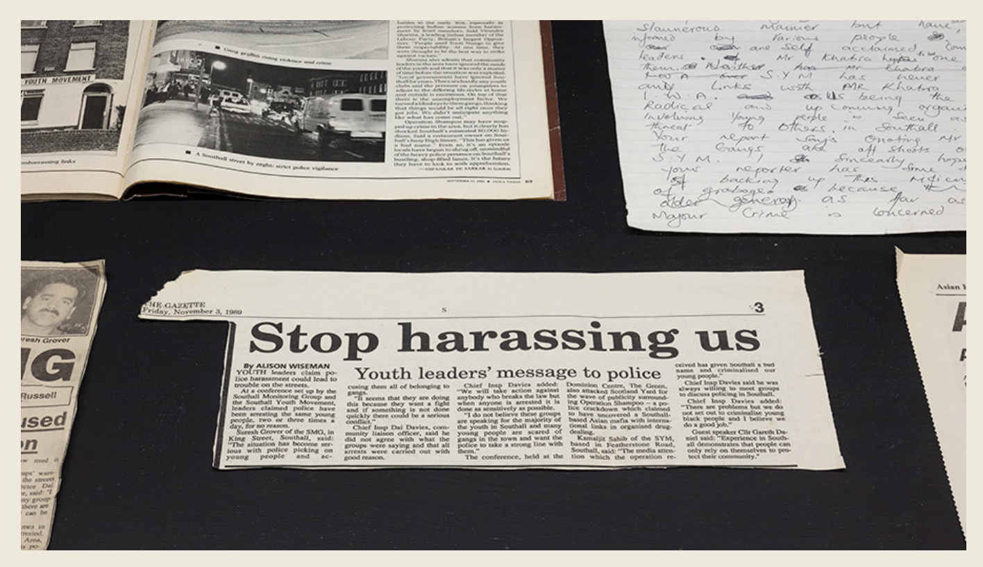
Prem Sahib, Archive, wood, painted steel, acrylic, archival material belonging to Kamaljit Sahib, 79 x 300 x 80 cm, 2019