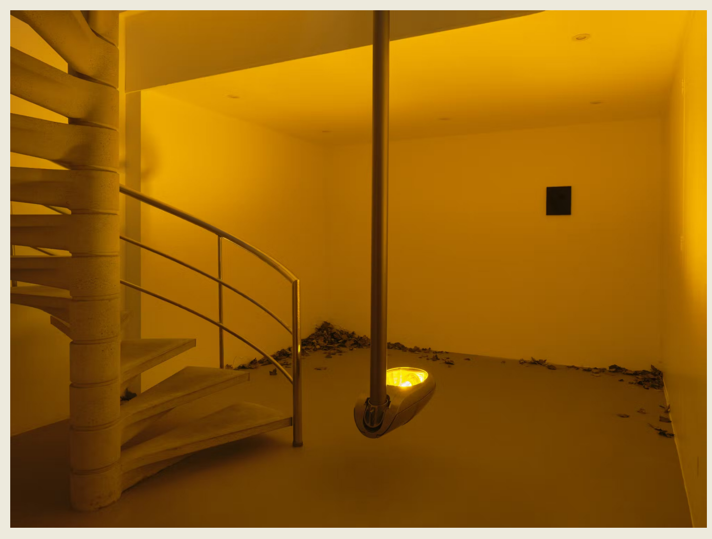
Prem Sahib, The Life Cycle of a Flea, Installation view, Phillida Reid, London, UK, 2023